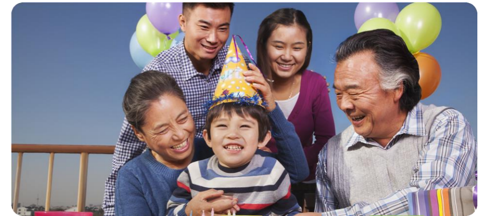
Birthdays happen every year.

Important life events include birthdays, religious festivals or family celebrations. Some life events happen every year and some happen at certain stages of human life.