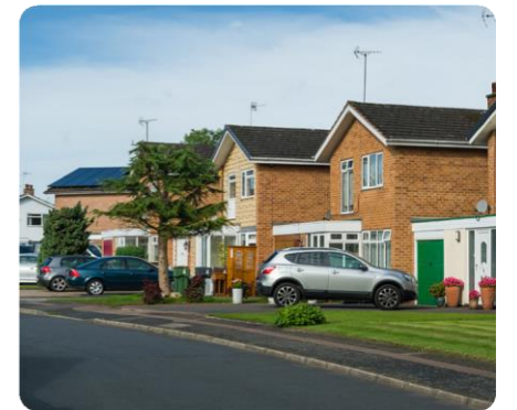
A street today.