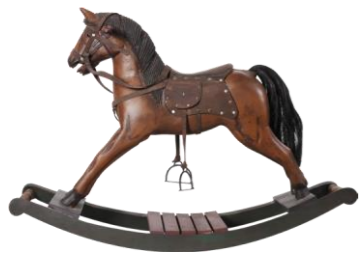
wooden rocking horse