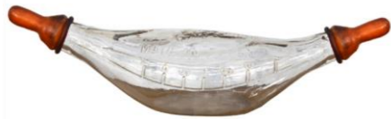
Victorian baby bottle

An artefact is an object from the past. Museums often display historical artefacts. Artefacts can tell us about how people used to live. Everyday objects like baby bottles, clothing, toys and books can tell us about childhood in the past.