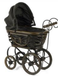
wood and metal pram